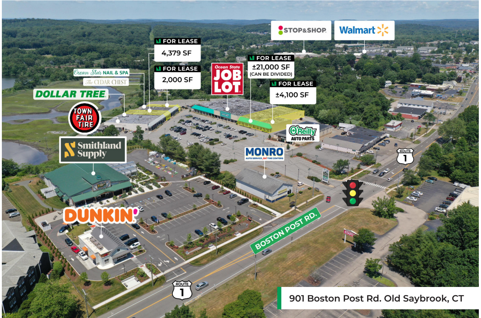
901 Boston Post Rd. Old Saybrook, CT