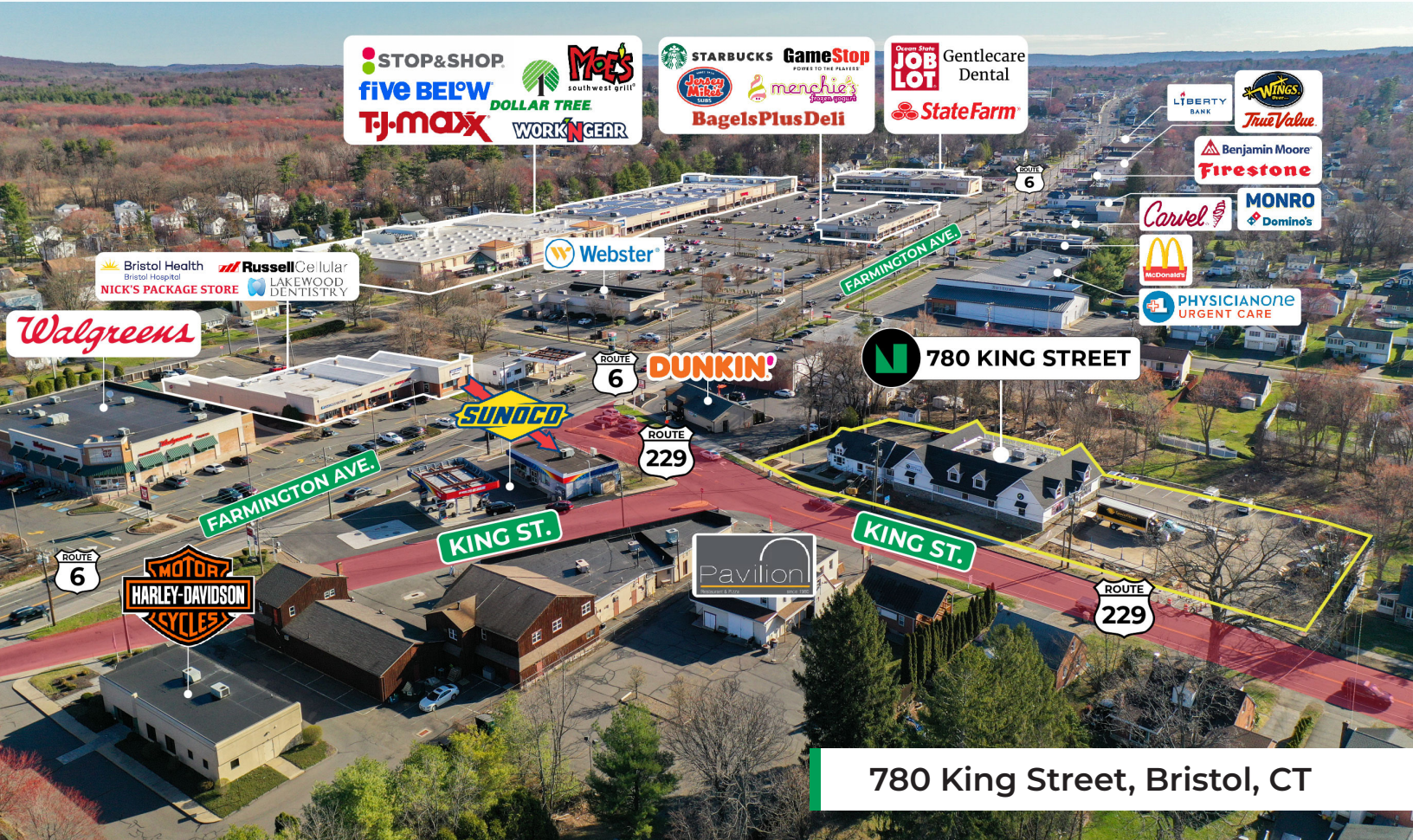
780 King Street, Bristol, CT